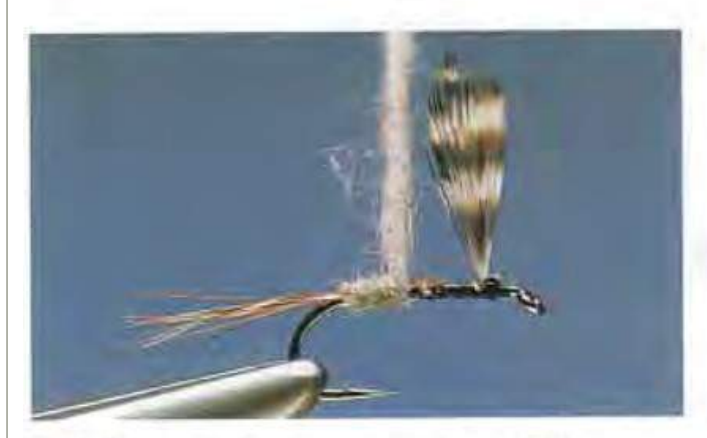
5 Offer a pinch of gray muskrat or rabbit underfur up to the thread. Dub it on to form a slim rope and wind up to the base of the wings to form the body.