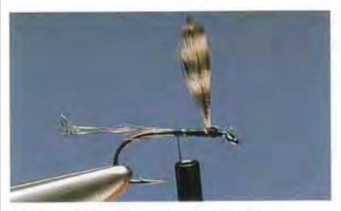
3 Part the hackle points, using the tip of a needle if necessary. Pull the bare stems through the gap and secure with thread along the shank. This ensures the tips remain apart.