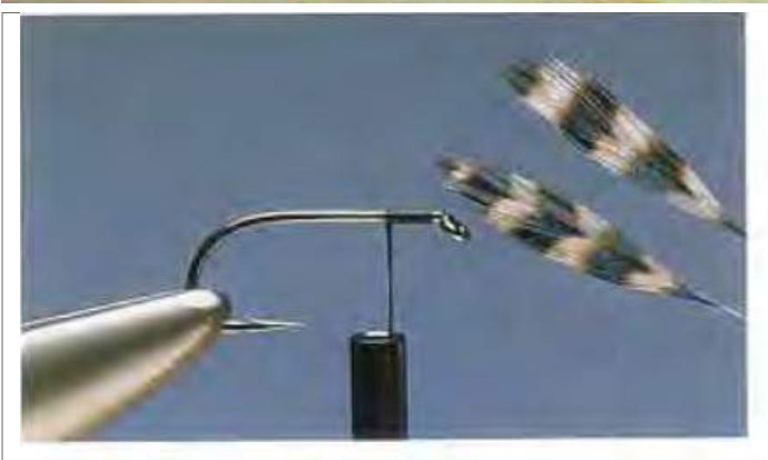
With the hook fixed in the vise, run the tying thread a short distance down the shank. Select two grizzle hackle points and remove the base fibers so the tips are the same length as the hook.