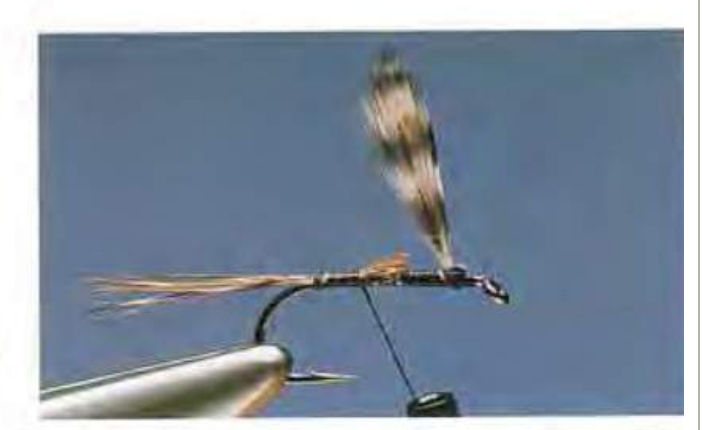
A Remove any excess hackle stem, then run the tying thread down the shank. Take a few fibers of brown and grizzle hackle and catch them in place.