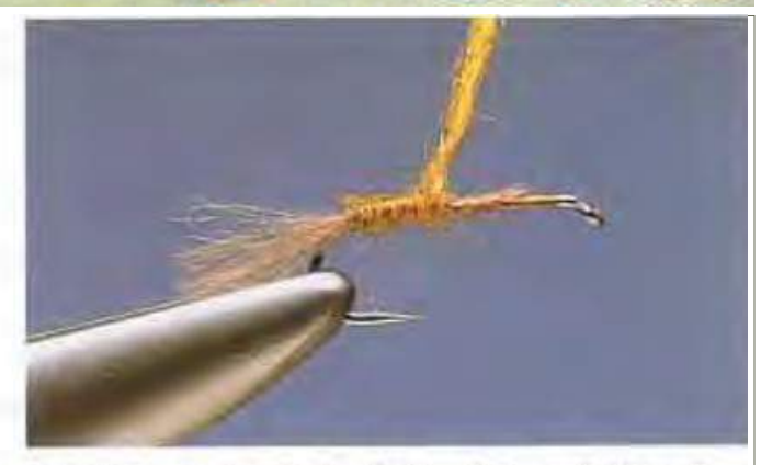
2 Tease out a pinch of olive Antron dubbing fur and apply it thinly to the tying thread. Twist it into a slim rope and wind it two-thirds of the way to the eye.