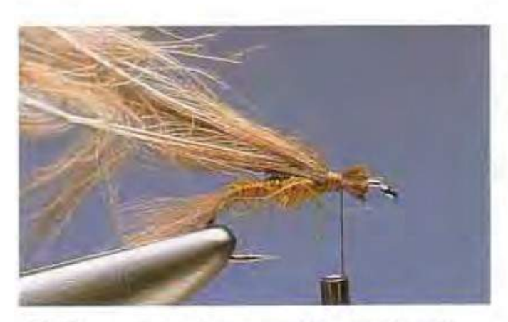
3 Choose two cul-de-canard plumes of equal size and of the same shade of gray. Put them together so that their tips are level and secure just in front of the body with a few turns of thread.