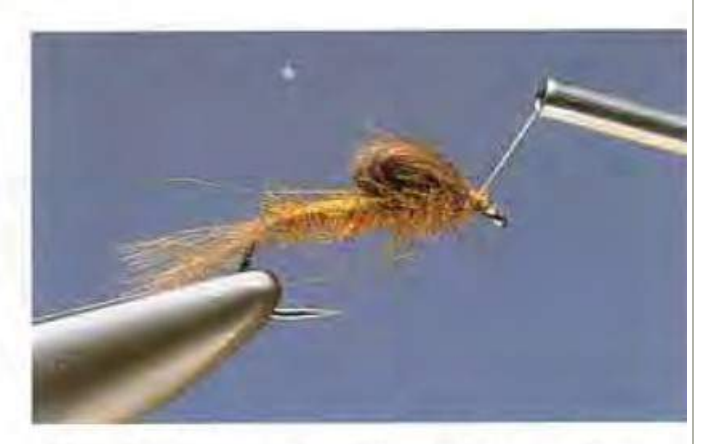
6 With the looped back formed, remove the excess plumes with scissors. Finally, build a small, neat head with the thread before casting off with a whip finish.