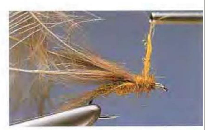
4 Take a second pinch of olive Antron and apply it to the tying thread. Wind the fur up to the eye to form a distinct thorax.