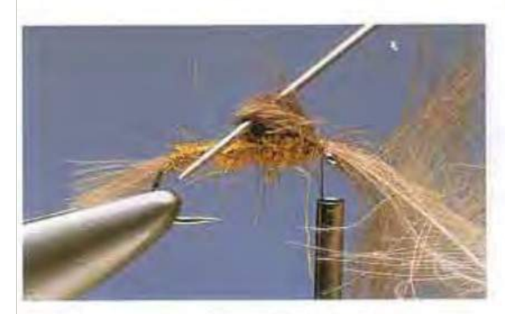
5 With the tying thread just behind the eye, take a needle and loop the cul-de-canard plumes around it. Keeping tension on the loop, secure the butts with thread at the eye.