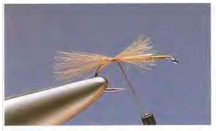
Fix the hook in the vise. Run the tying thread on at the eye and wind it down the shank in close turns to a point opposite the barb. Take a pinch of gray cul-de-canard fibers and catch it in as the tail.