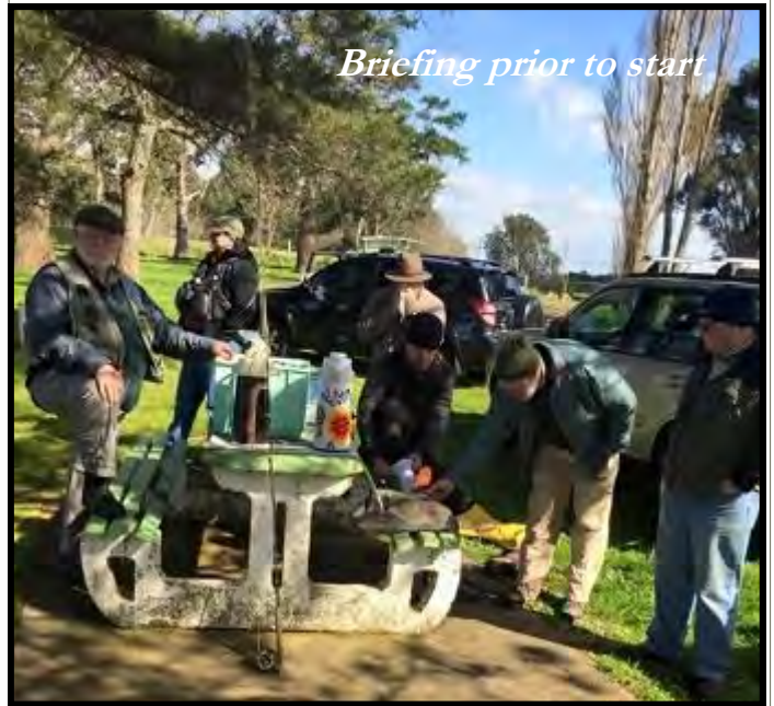
Briefing prior to start

Nevertheless, all present had a great time and enjoyed the BBQ lunch and chat with friends.