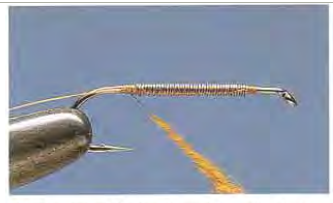
Fix the hook in the vise and form a lead wire underbody. Run on the tying thread and catch in 3 inches (7.5cm) of oval, gold tinsel at the bend. Dub on a generous pinch of dyed olive rabbit fur.