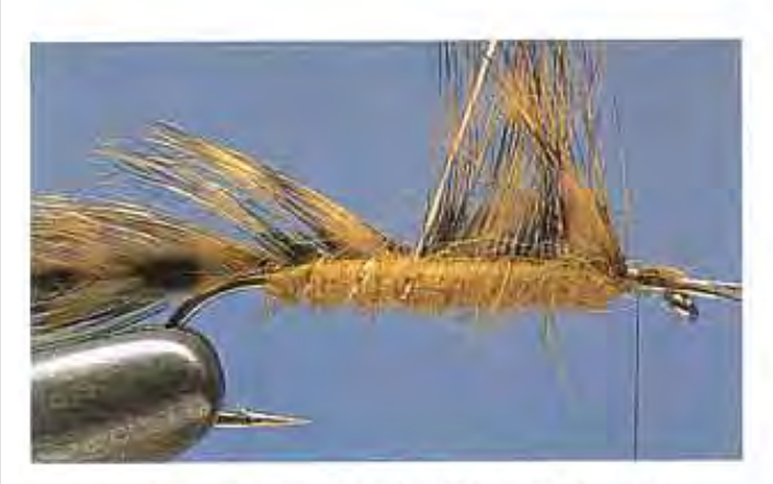
5 Moisten the wing and pull it over the body. Divide the hackle fibers at the tail and make one turn with the tinsel. Wind the tinsel through the hackles in evenly spaced turns, dividing the hair as you go.