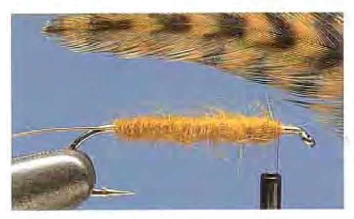
3 Select two pairs of grizzle cock hackles dyed olive. Place them dull-sides together so that all the tips are level. This will form a straight wing.