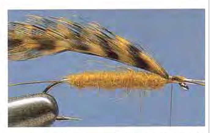
A Remove the fibers at the base so the wing is the correct length. Then, tear off the fibers under the wing for the same length as the body. Catch in at the eye.