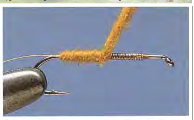
2 Using a simple twisting action between finger and thumb, work the rabbit fur into a tapering rope. Wind the rope in touching turns along the hook shank.