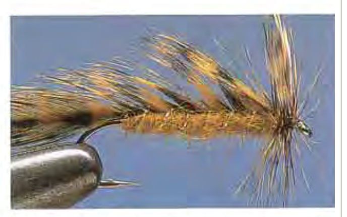
Add a collar of dyed olive grizzle hackle and cast off.