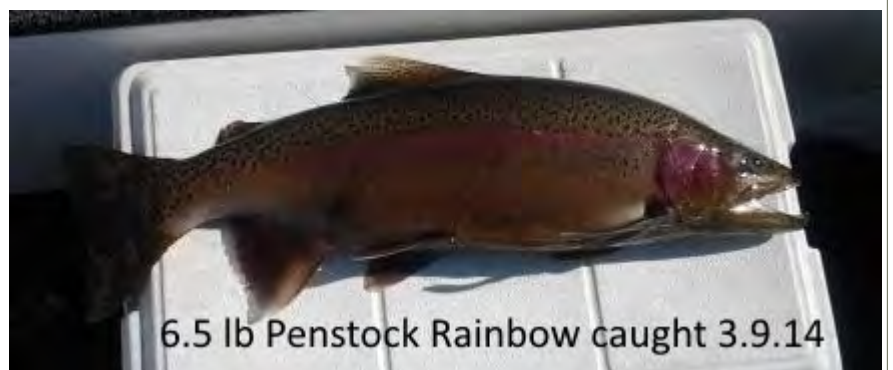
6.5 lb Penstock Rainbow caught 3.9.14