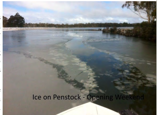
Ice on Penstock - Opening Weekend

As the season progresses I am looking forward to the Mayfly hatches and the rivers to come on. In the mean time I will be visiting many of the other lakes around here, luckily all within one hour from our front door.