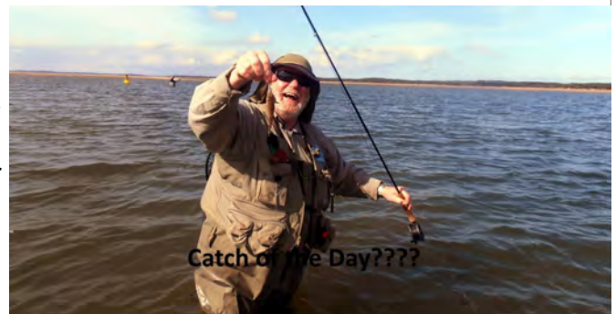
Catch of the Day????

Another enjoyable outing despite the lack of fish!