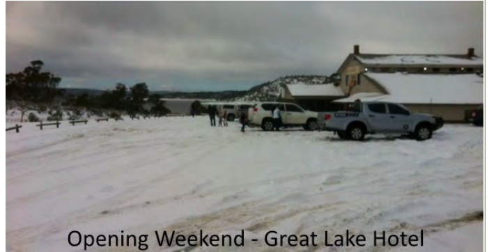
Opening Weekend - Great Lake Hotel

IFS (Inland Fisheries) put some nice fish (2000) in the lake, taken from Arthur's during the spawning run, and many of these were caught.