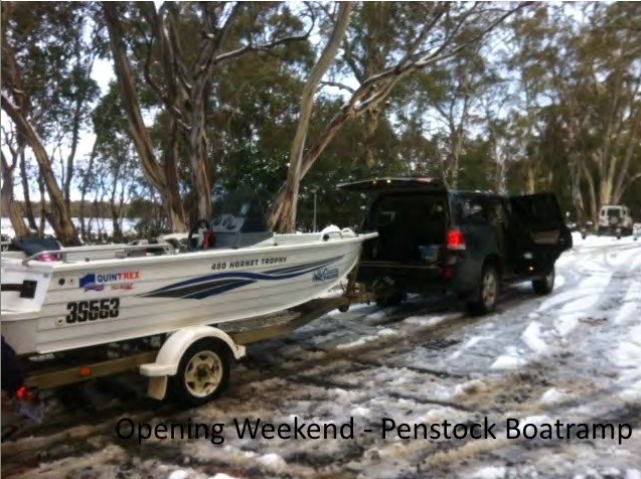
Opening Weekend - Penstock Boatramp

On both days between 2 boats, some 40 fish were caught and released. I have attached on the following email, a couple of photos of Penstock boat ramp, snow covered roads and the iced lake.