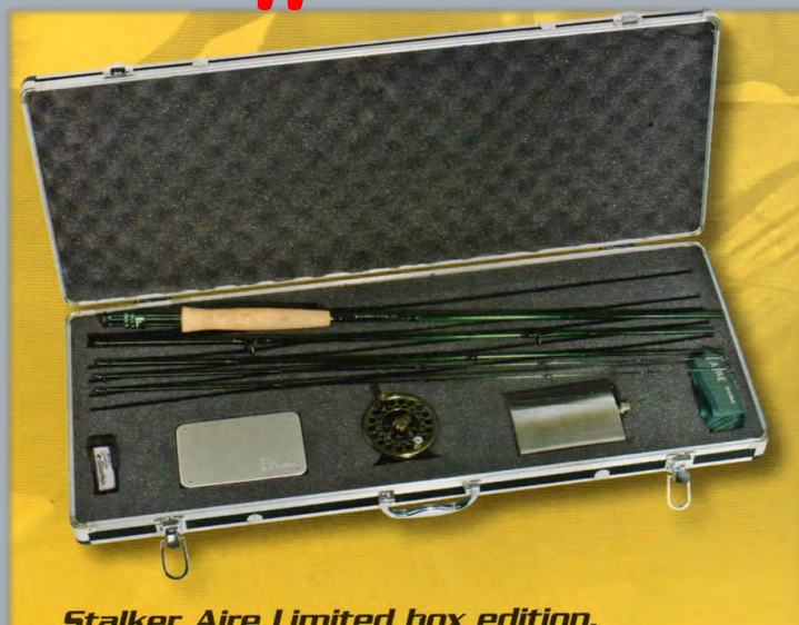
Stalker Aire Limited box edition.