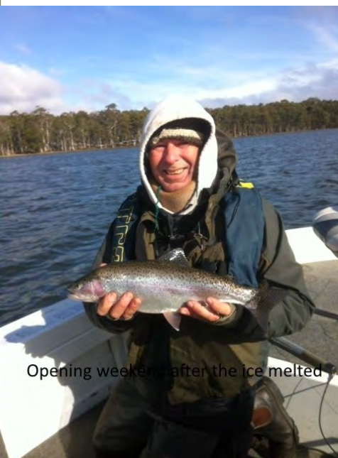
Opening weekend after the ice melted

I will keep you up to date with all the news and the best techniques for success as the season progresses.