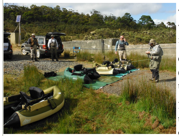
Float tube brigade at Little Pine Lagoon

The remainder of the week saw a variety of lakes fished wading, off the bank, float tubing and boating—with varying success.