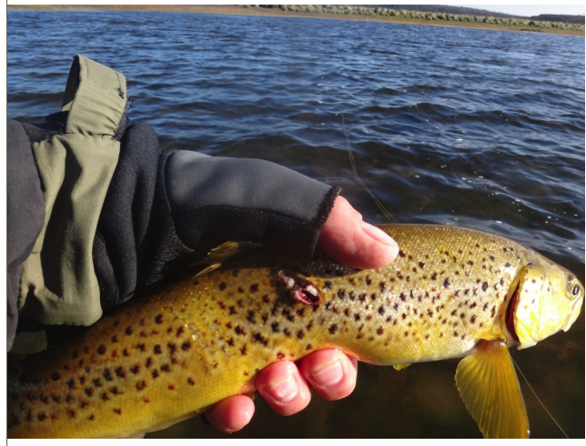
An injured fish from Lake Kay-cormorant perhaps?

Next year's trip has been booked—this time a month later trying for some cooler weather and possibly better fishing conditions.