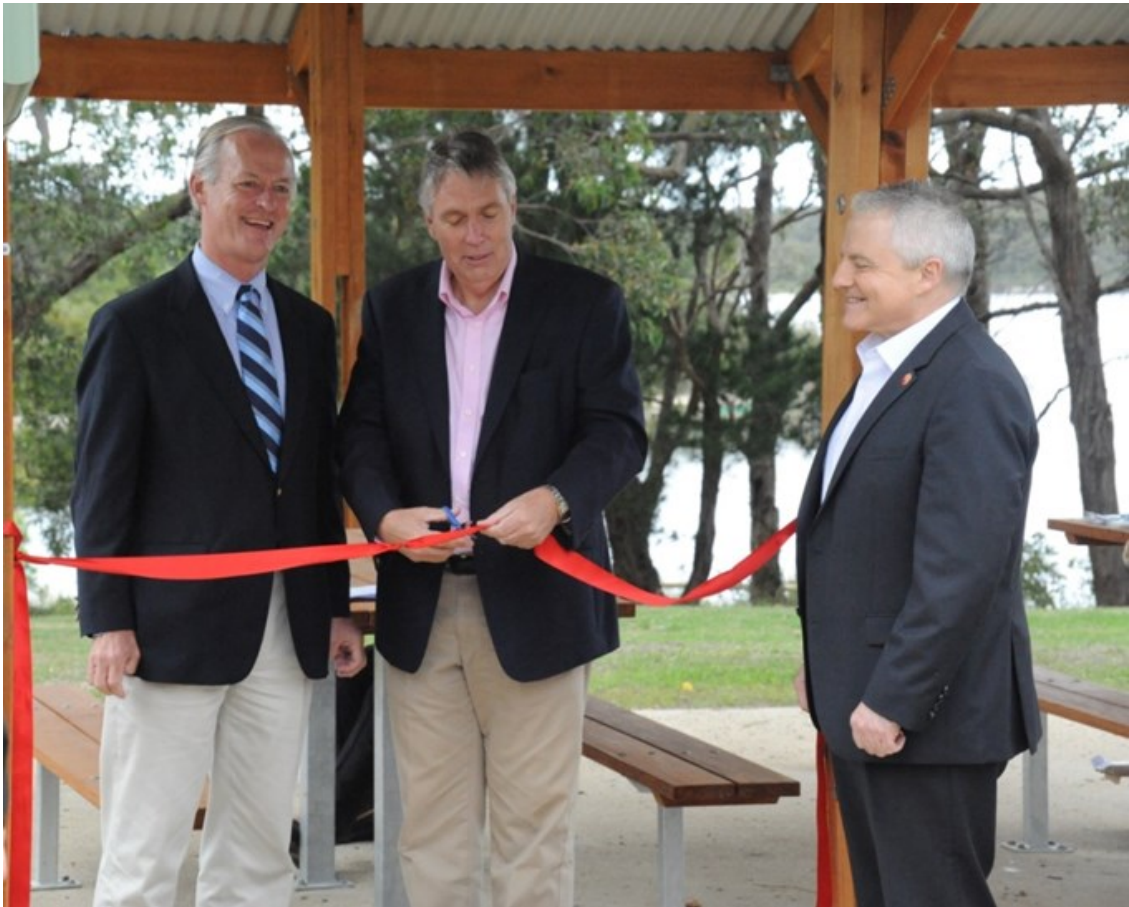
Official opening (at last!!)