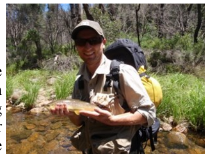
Polarised sunnies and hat

The use of good polarising sunglasses are a must on sunny days, it cuts the glare off the water and makes seeing trout and your fly or lure so much easier. A hat or cap will also keep the glare off your glasses or eyes helping even more. By being able to see through into the water we are able to better see fish holding structure, the fish themselves or any follows we may have on our lures or fly's.