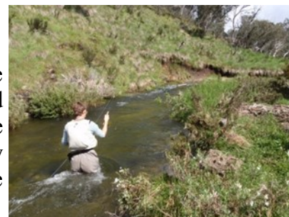
Waders make it easier

Wading into the rivers will help by being able to access so many more places where the fish are holding. Also it gives better casting angles and allows to cover the river much more efficiently. 95% of our fishing is done standing in the river itself. Waders are also much more affordable than they were, and for shorter trips you do not need really good gortex waders like simms etc, but a $50 pair of rubber waders will work fine.