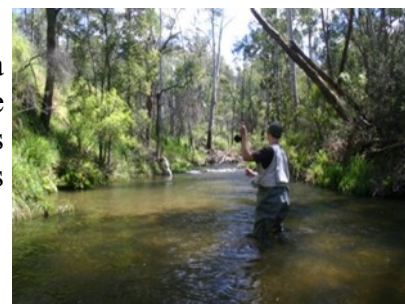
Stay to shadows

Fish have remarkably good eyesight, and will see movement from quite a distance. So stealth is a must, wear dull coloured clothing, keep low, make slow deliberate movements and try and stay to the shadows as much as possible. This especially rings true in smaller rivers where the fishing is close and the fish may only be a few meters in front of you.