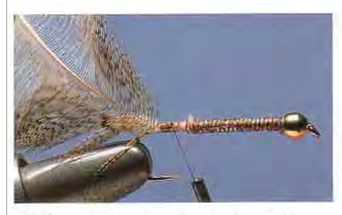
Prepare a brown partridge hackle, stroking the fibers away from the tip. Catch it in by its tip, at the base of the yarn body.