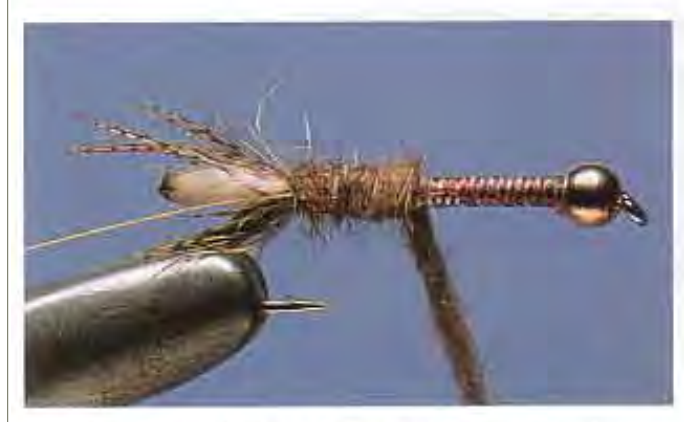
5 Catch in 3 inches (7.5cm) of fine, gold wire before applying a body of dubbed hare's fur.