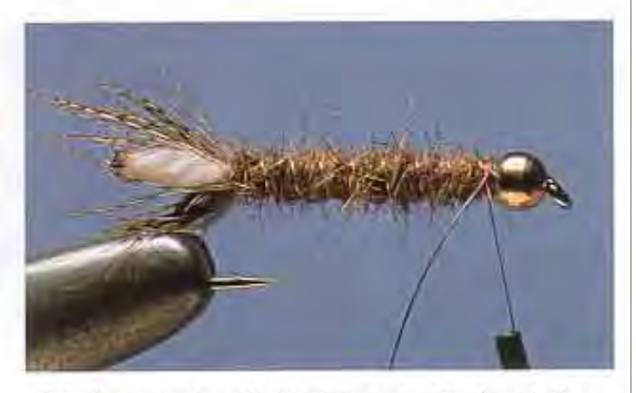
6 Carry the hare's fur right up to the bead, then wind evenly spaced turns of the gold wire to form the rib. Secure the wire and remove the excess. Cast off the tying thread.