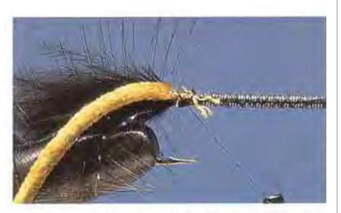
A Prepare a black saddle hackle by stroking the fibers back from the tip, then catch it in at the base of the tail. Take 3 inches (7.5cm) of olive chenille and remove a section to leave a bare core. Use this core to catch the chenille in at the tail base.