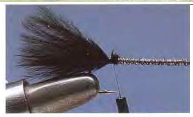
2 Replace the hook in the vise. Run the tying thread on at the eye and carry it down to the bend, past the end of the lead. Catch in a short bunch of black turkey marabou.