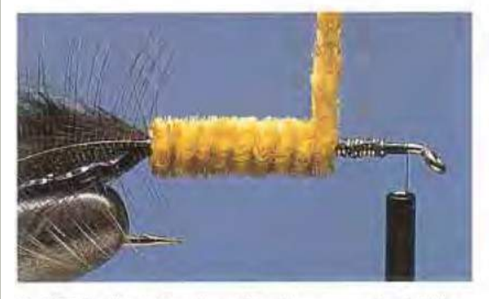
5 Take the tying thread to the eye and wind the chenille on in touching turns to a point just short of the eye.