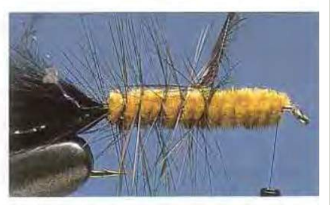
6 Secure the loose end of the chenille with tying thread and remove the excess. Wind the hackle up to the eye in evenly spaced turns. At the eye, make three close turns to form a collar. Secure and remove the excess. Cast off the thread.