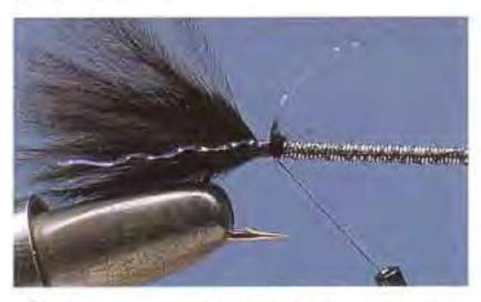
3 Secure the marabou with tight thread wraps, allowing the waste ends to fill the gap left at the rear of the lead wire. Take a strand of pearl Crystal Hair twice the length of the tail. Fold it in half and catch in at the tail base.